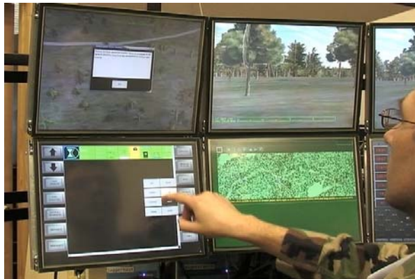
Figure 2. C2V ITS Training Event

The C2V ITS consists of the C2V crewstation hardware itself, which includes a six screen Soldier interface with “on-board” views for the C2V vehicle, as well as screens for controlling unmanned vehicles and viewing sensor imagery. The testbed software includes the simulation, image generators, and control tools to drive the exercise. The ITS is integrated with this testbed, monitoring Soldier actions and providing real-time feedback on errors or deficiencies, while also logging this information for after action review (AAR). In a previous effort, (Jensen et al, 2005), the integrated ITS was used in experiments conducted with human test subjects, where it was found to deliver effective learning comparable to human-led AAR. Figure 2 below shows a feedback message being delivered on the unmanned vehicle imagery screen during an exercise. This kind of feedback event is logged, and ultimately contributes to the assessment scores that can be mapped back to learning objectives in an external course.