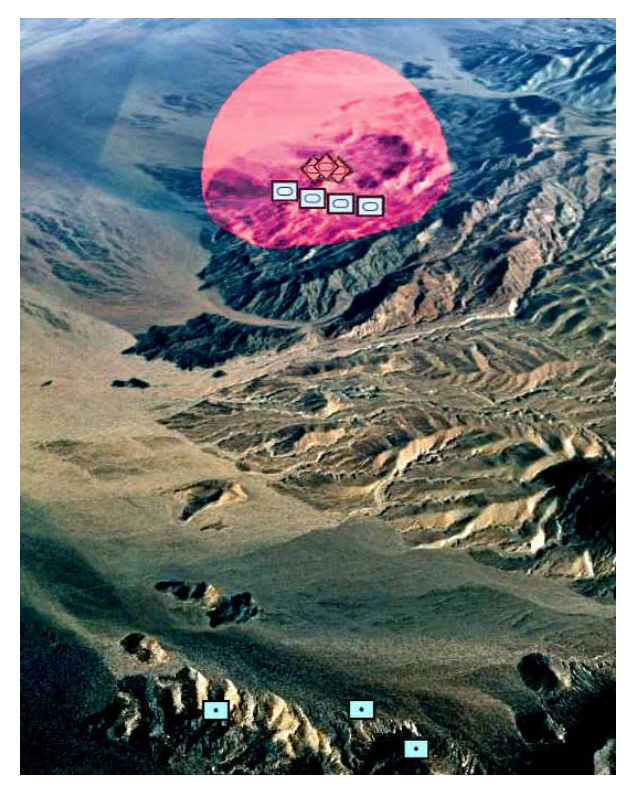
Figure 1. Artillery MSD conflict

Safely coordinating indirect fires in consonance with maneuver is an integral focus in CACCTUS combined arms training objectives. An example of a significant event, or friction point, that may occur during an exercise is described below and represented in the following illustration.